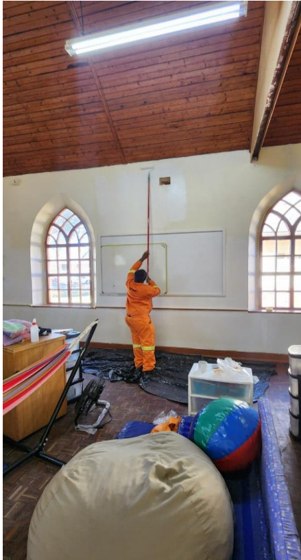
Youth in Cape Winelands assisting an NGO with basic maintenance work